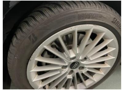
Front left rim - Scratch