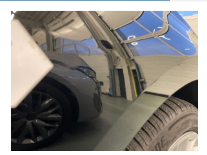
Front left screen - Dent