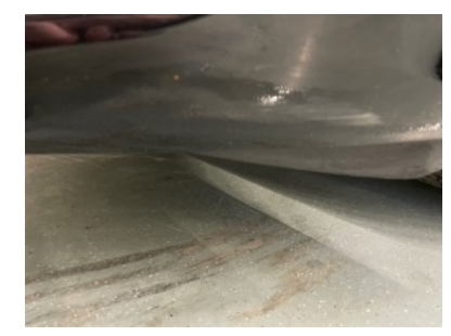
Front bumper - Scratch