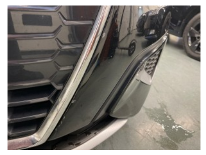
Front bumper - Paint repair