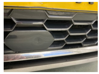
Front bumper - Dent