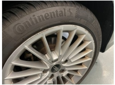
Rear right rim - Scratch