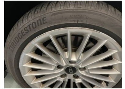
Rear left rim - Scratch