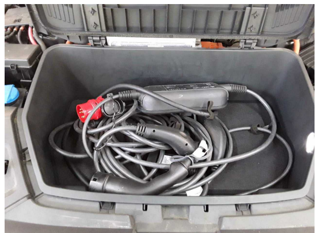
Figure 12: Misc.