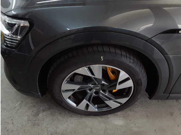
Damage #1: Wheel / tyres: Alloy rim - front left side - Scratched - Loss in value