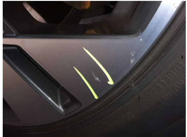
Damage #2: Wheel / tyres: Alloy rim - rear right side - Scratched - Loss in value