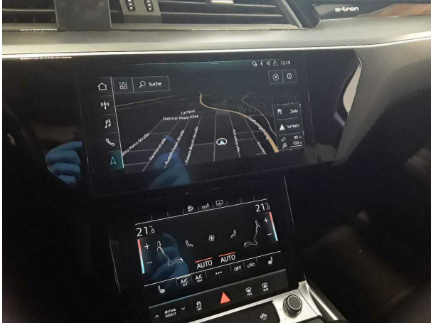
Figure 7: Interior