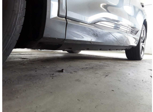
Figure 14: Misc.