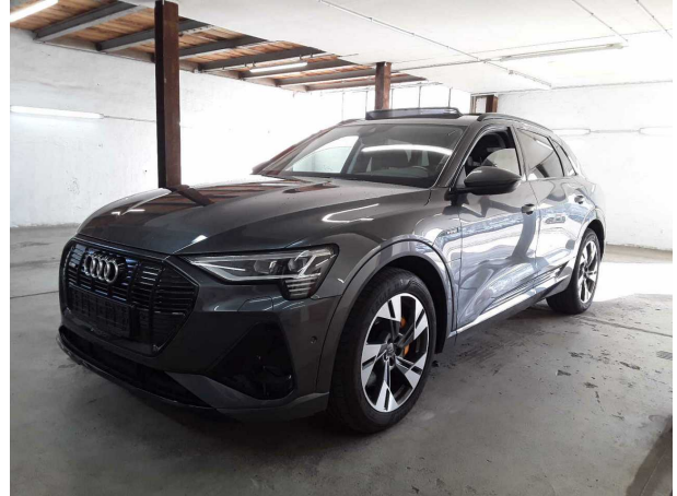
Figure 2: Diagonal front