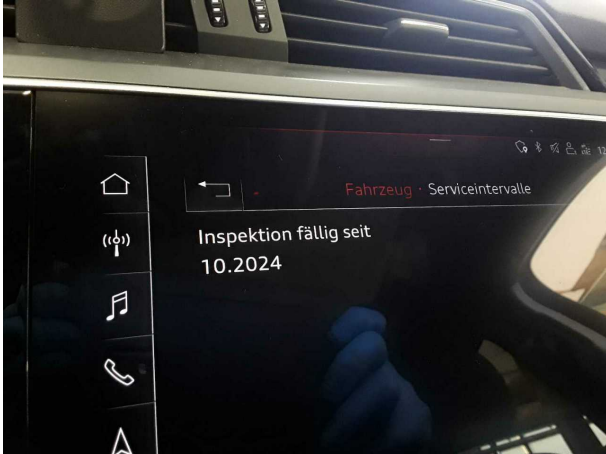
Damage #4: Misc.: Inspection / maintenance - Due - Replace