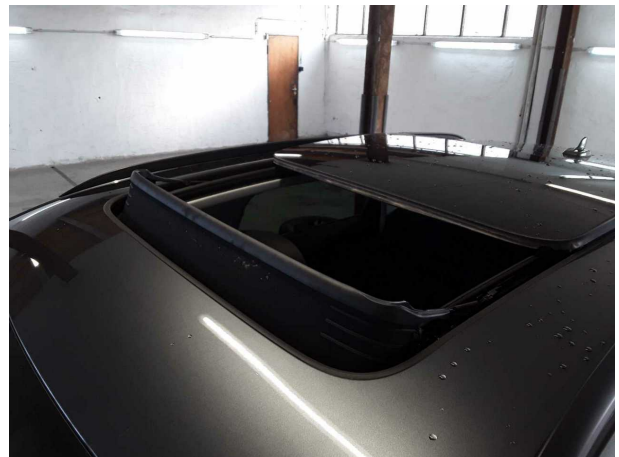
Figure 16: Misc.