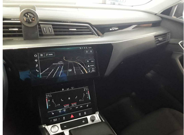
Figure 8: Interior