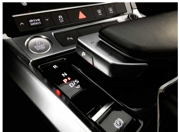
Figure 6: Interior