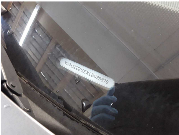
Figure 15: Misc.