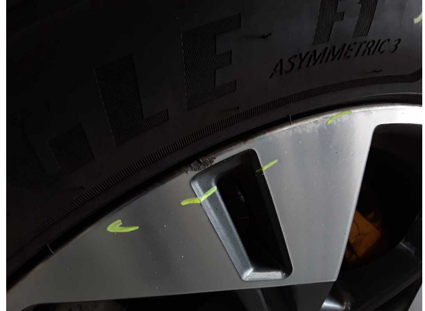
Damage #1: Wheel / tyres: Alloy rim - front left side - Scratched - Loss in value