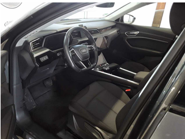
Figure 5: Interior