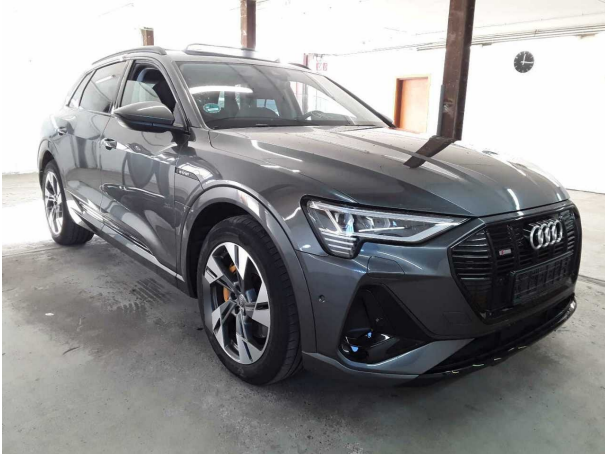
Figure 1: Diagonal front