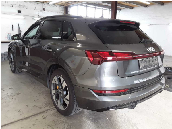
Figure 3: Diagonal rear