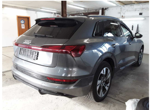
Figure 4: Diagonal rear