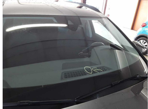
Damage #5: Vehicle glazing: Windscreen (Rissbildung) - Stone chips - Replace