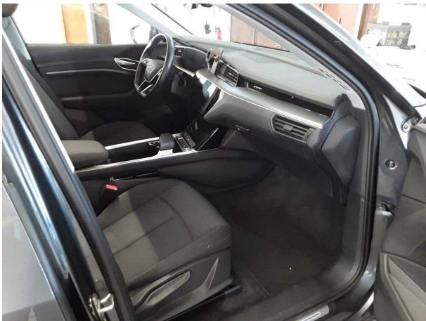
Figure 9: Interior