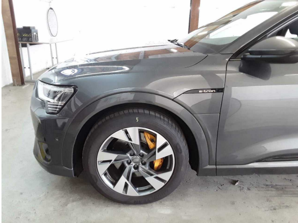
Figure 13: Misc.