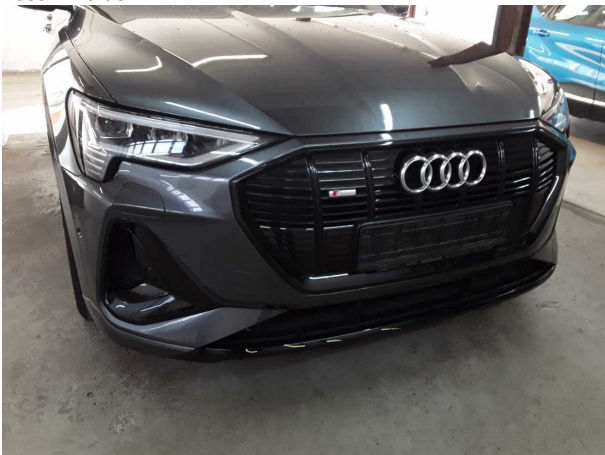
Damage #3: Front bumper: Spoiler - Scratched - Smart repair