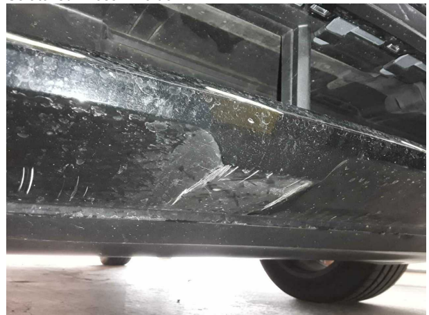
Damage #3: Front bumper: Spoiler - Scratched - Smart repair