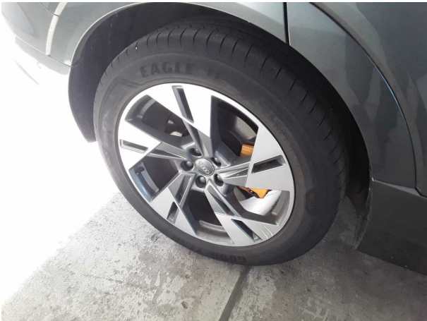
Damage #2: Wheel / tyres: Alloy rim - rear right side - Scratched - Loss in value