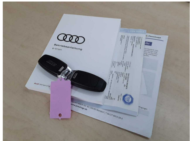
Figure 10: Misc.