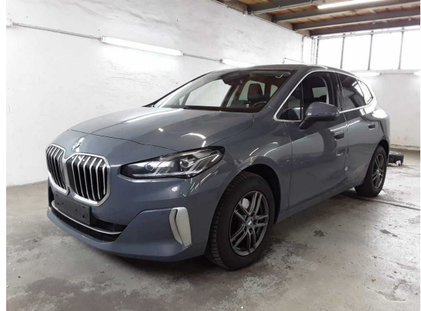
Figure 2: Diagonal front