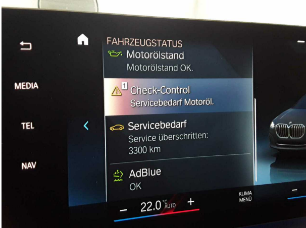
Figure 19: Misc.