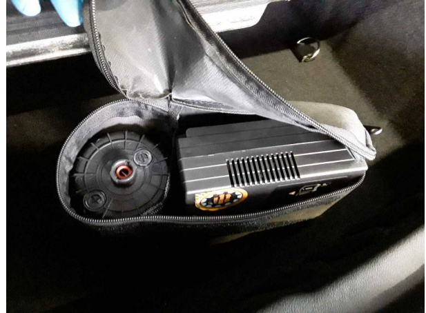
Figure 20: Misc.