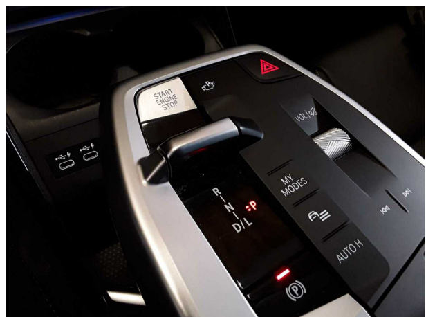
Figure 6: Interior