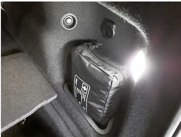
Figure 21: Misc.