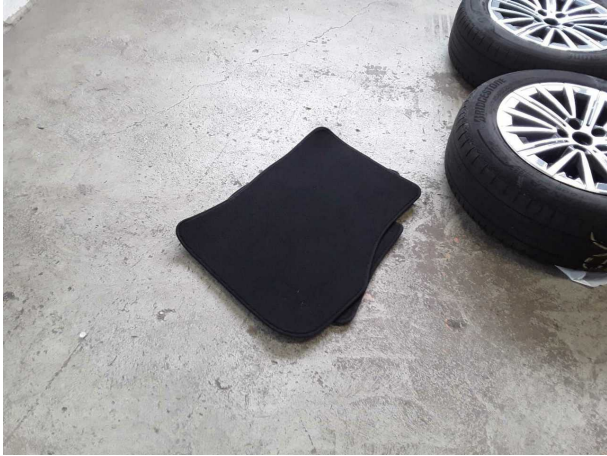
Figure 13: Misc.