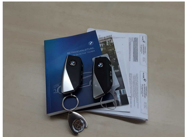
Figure 10: Misc.