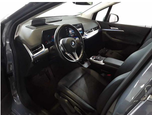
Figure 5: Interior