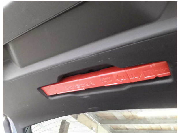
Figure 22: Misc.