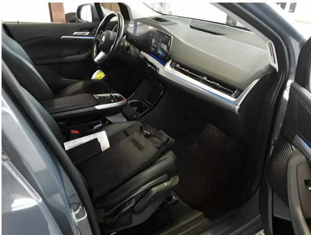
Figure 9: Interior