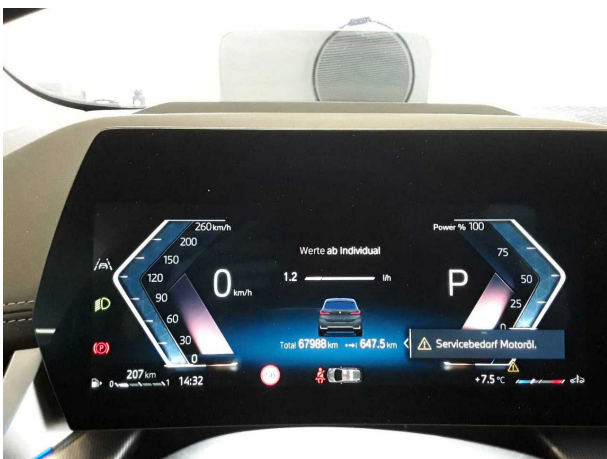
Figure 17: Misc.