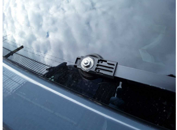
Damage #2: Screen cleaning: Wiper arm - rear (Abdeckung fehlt) - Replace