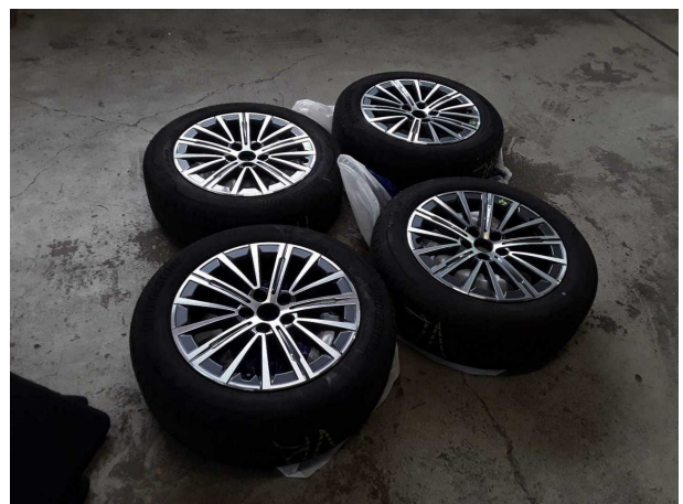
Figure 12: Misc.