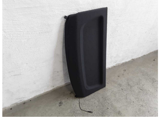
Figure 14: Misc.