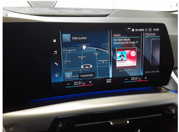
Figure 8: Interior