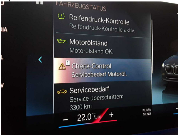
Damage #3: Misc.: Inspection / maintenance - Due - Replace