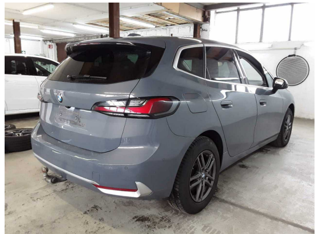
Figure 4: Diagonal rear