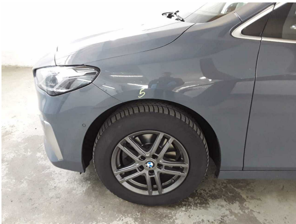
Figure 15: Misc.