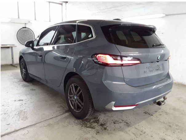
Figure 3: Diagonal rear