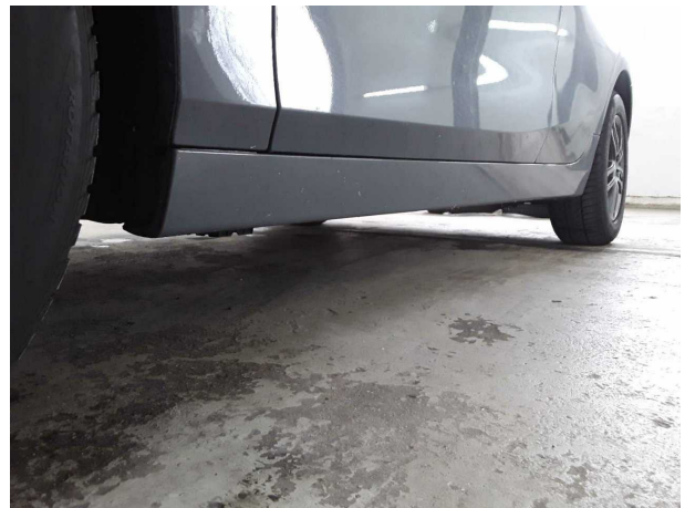
Figure 16: Misc.