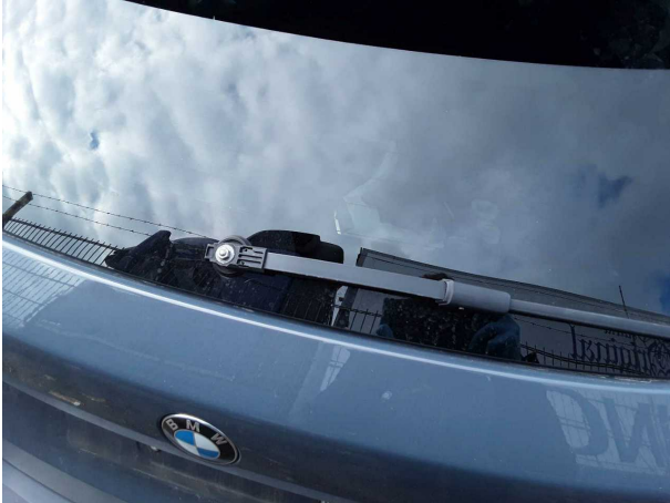
Damage #2: Screen cleaning: Wiper arm - rear (Abdeckung fehlt) - Replace