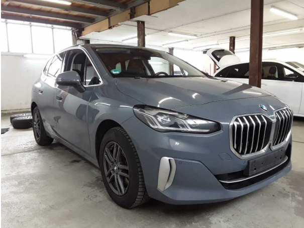
Figure 1: Diagonal front