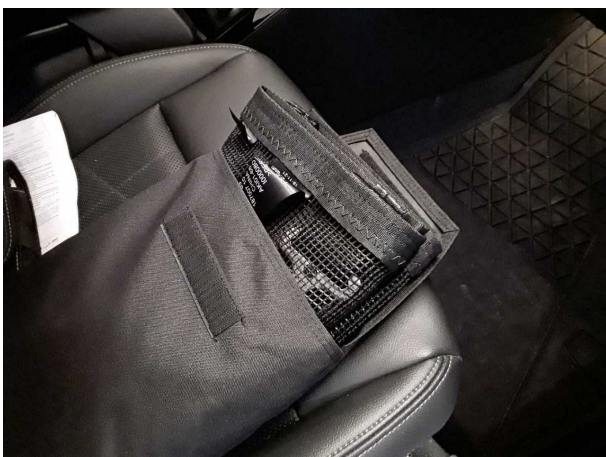
Figure 11: Misc.