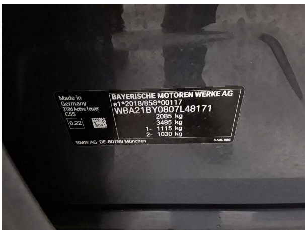
Figure 23: Misc.