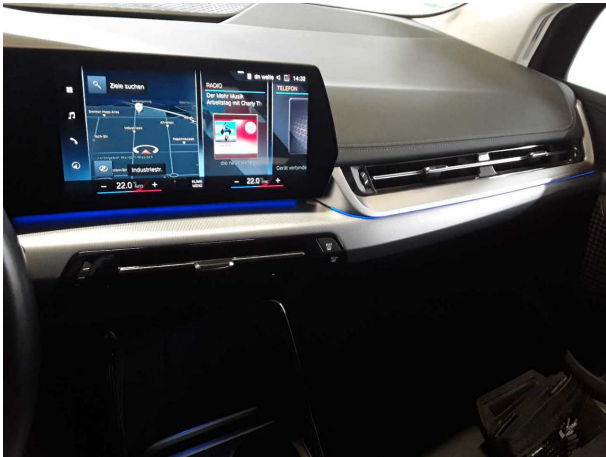
Figure 7: Interior