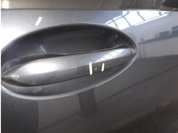
Damage #1: Door - front right side: Door handle - outside - Scratch(es) - Cover / polish