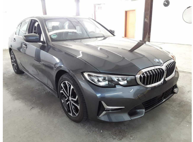
Figure 2: Diagonal front