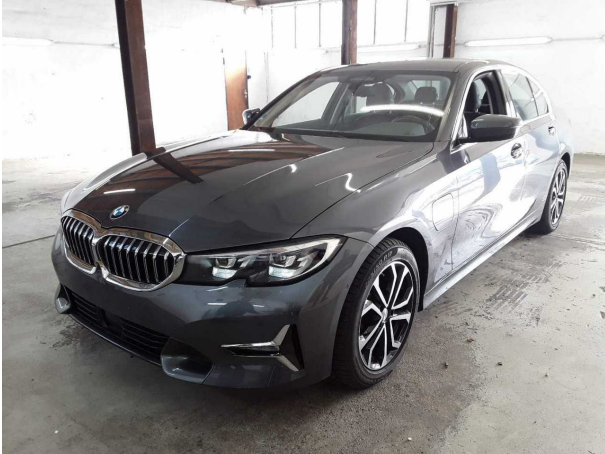
Figure 1: Diagonal front