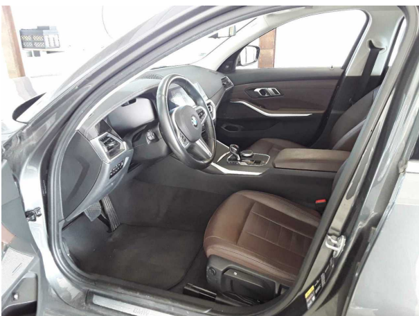
Figure 5: Interior