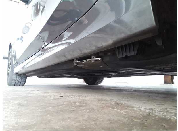
Figure 20: Misc.