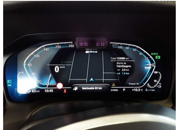
Figure 14: Misc.