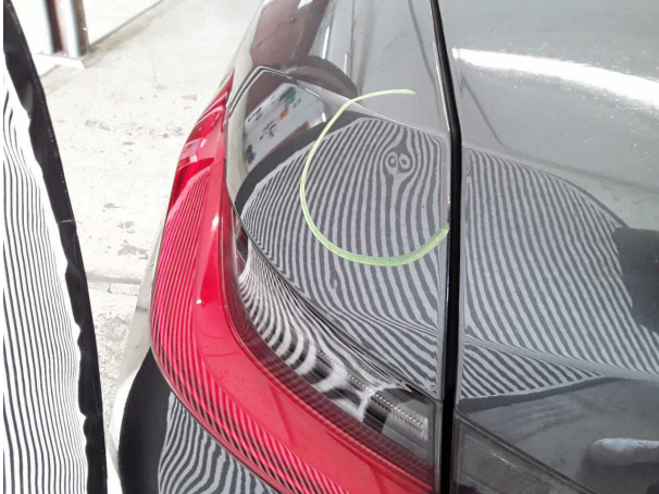
Damage #3: Side panel - rear left side: Side panel - dent(s) - Smart repair