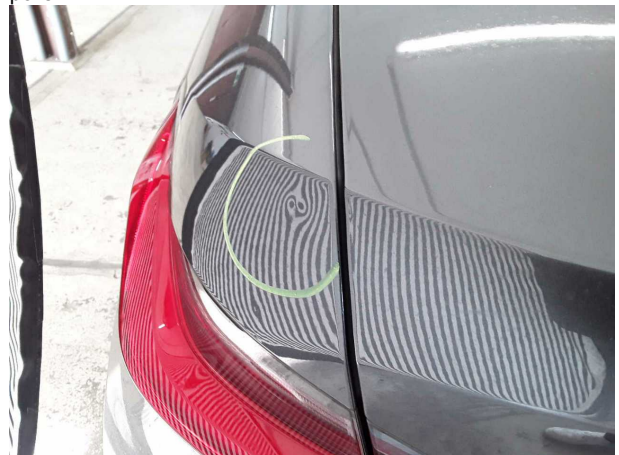
Damage #3: Side panel - rear left side: Side panel - dent(s) - Smart repair