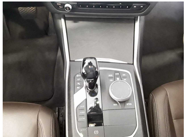
Figure 10: Interior