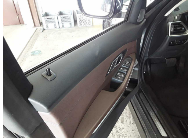
Damage #4: Trim / covers: Door trim - front left side - dent(s) - Replace