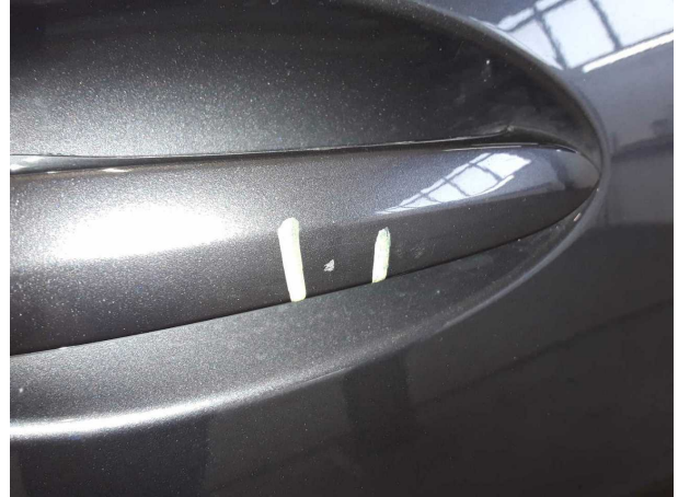
Damage #1: Door - front right side: Door handle - outside - Scratch(es) - Cover / polish