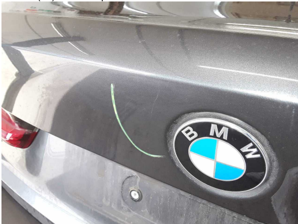
Damage #2: Boot lid / rear door: Boot lid - Scratch(es) - Cover / polish