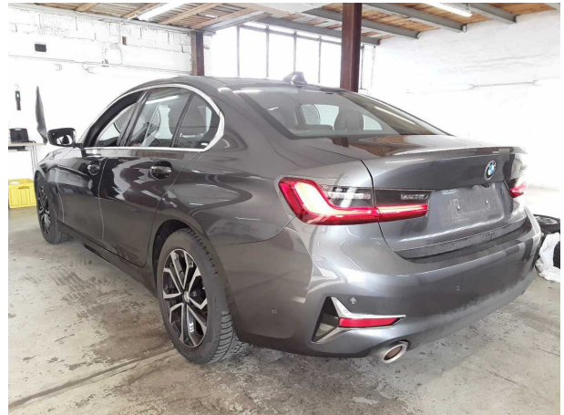
Figure 4: Diagonal rear