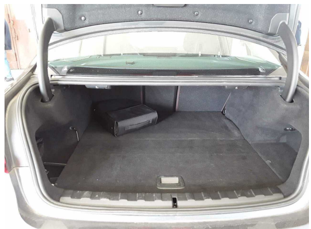
Figure 6: Interior