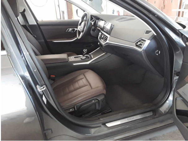
Figure 7: Interior