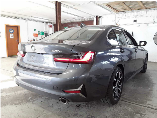
Figure 3: Diagonal rear