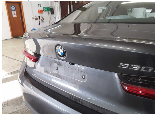
Damage #2: Boot lid / rear door: Boot lid - Scratch(es) - Cove... polish