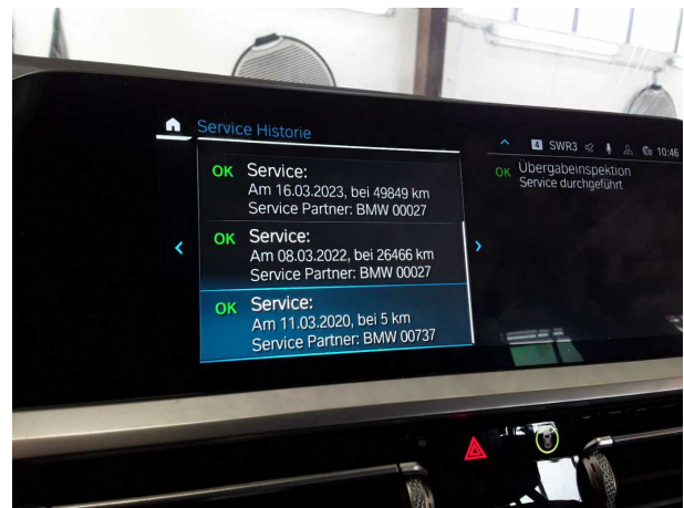
Figure 16: Misc.