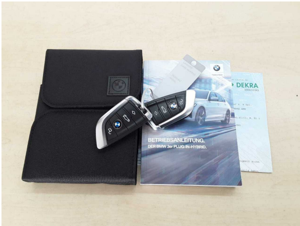
Figure 13: Misc.