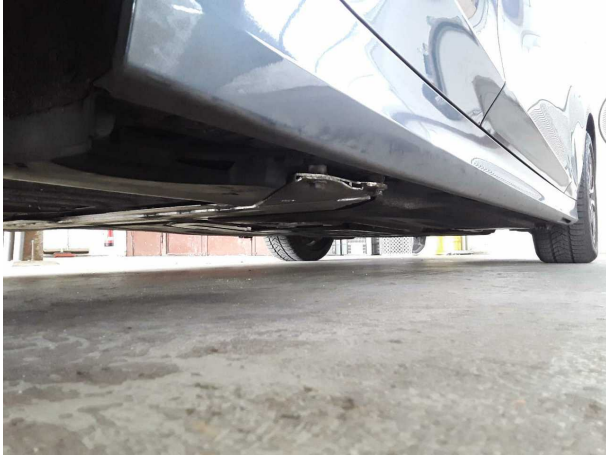
Figure 19: Misc.