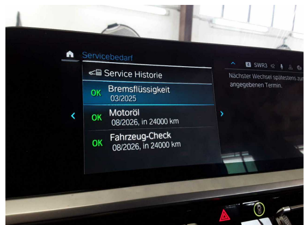
Figure 18: Misc.