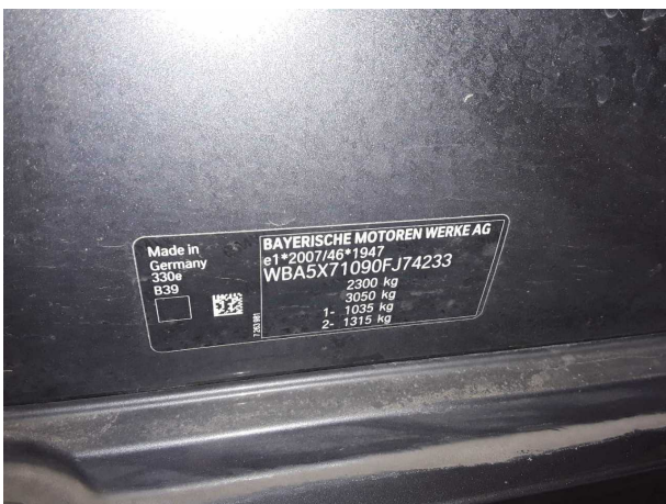
Figure 11: VIN