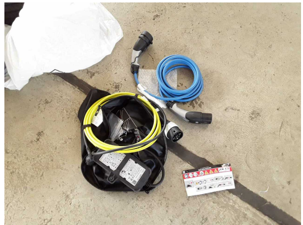
Figure 22: Misc.