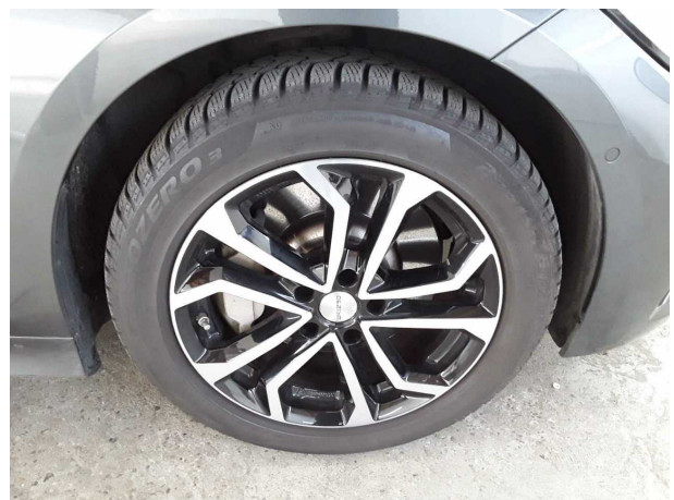
Figure 12: Mounted tyres