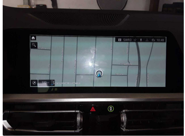
Figure 8: Interior