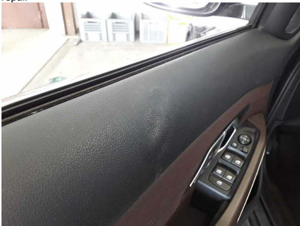
Damage #4: Trim / covers: Door trim - front left side - dent(s) - Replace