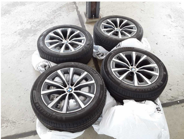
Figure 21: Misc.