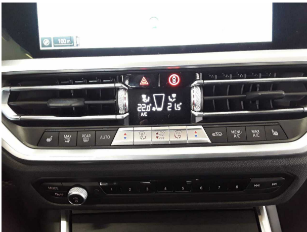
Figure 9: Interior