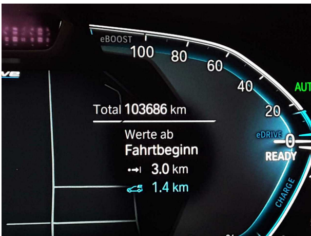
Figure 15: Misc.