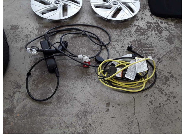
Figure 20: Misc.