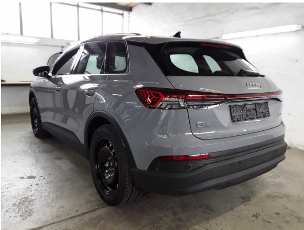
Figure 3: Diagonal rear