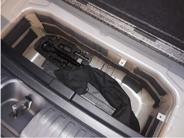
Figure 25: Misc.