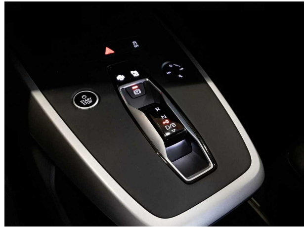
Figure 8: Interior