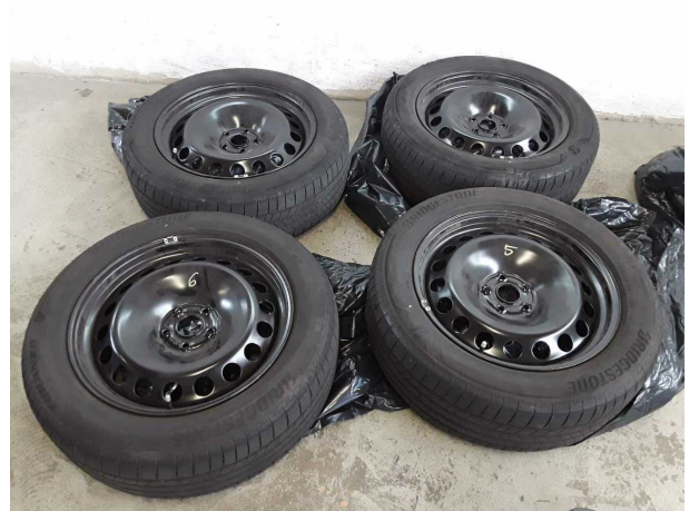
Figure 22: Misc.