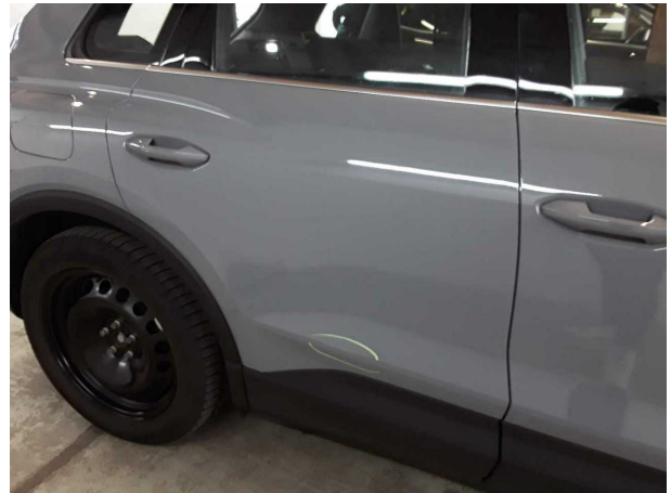
Damage #3: Door - rear right side: Door - Scratched - Paint