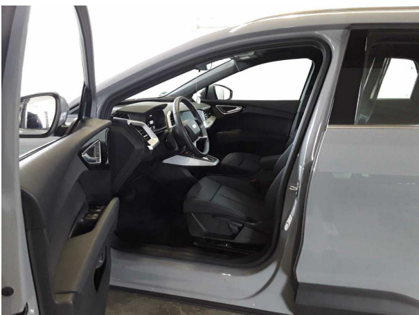
Figure 5: Interior