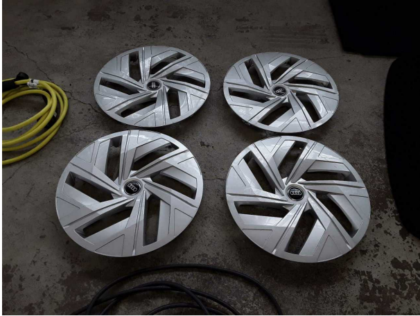
Figure 19: Misc.