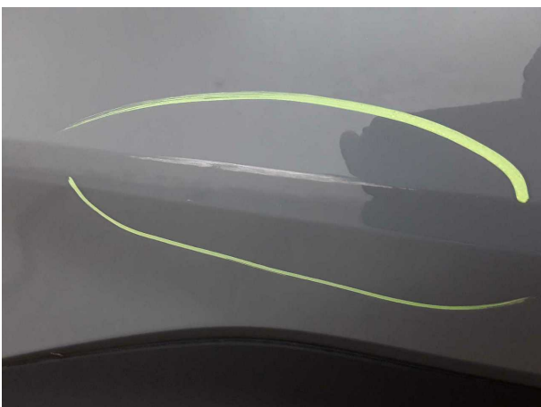
Damage #3: Door - rear right side: Door - Scratched - Paint