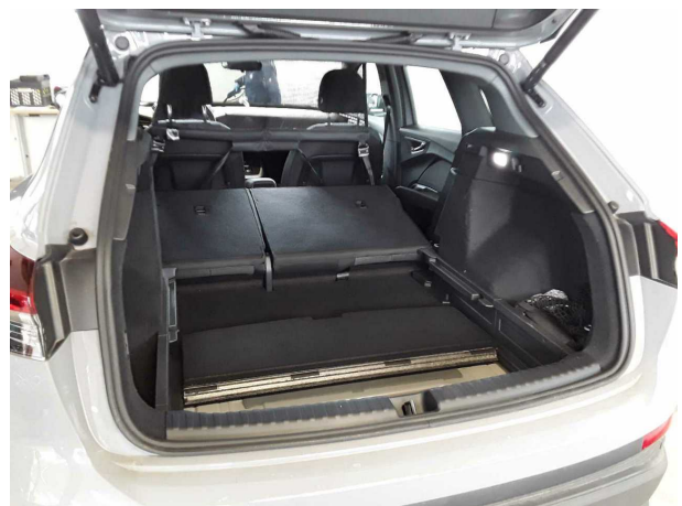
Figure 24: Misc.