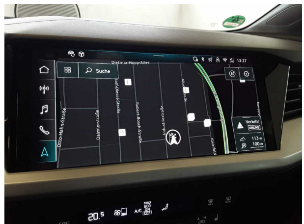
Figure 6: Interior