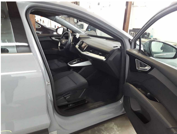
Figure 9: Interior