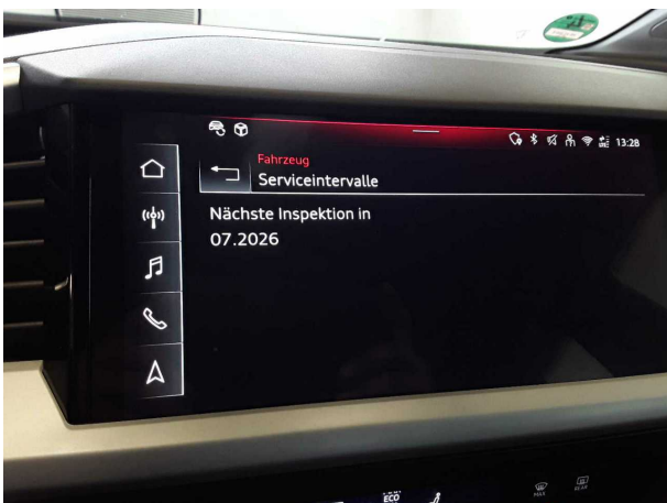
Figure 17: Misc.