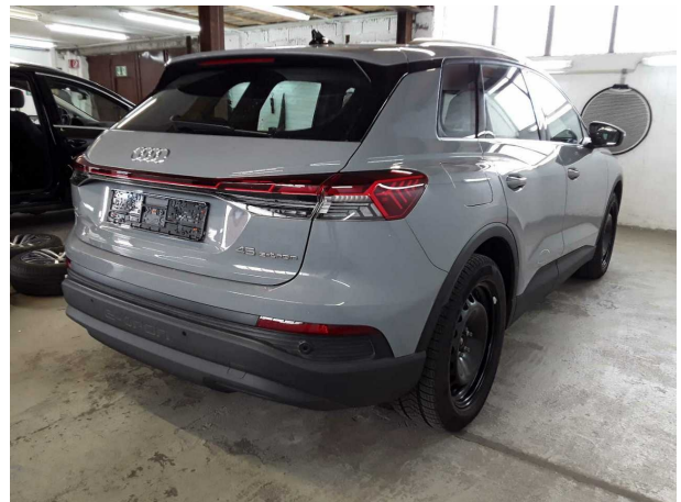
Figure 4: Diagonal rear