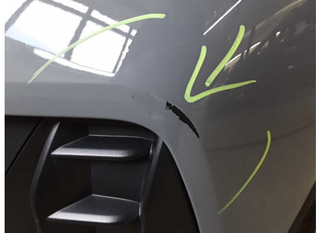
Damage #2: Front bumper: Front bumper - Scratched - Paint