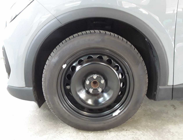
Figure 13: Misc.