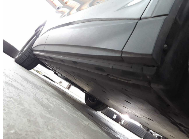
Figure 14: Misc.