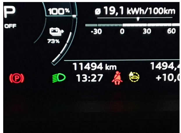
Figure 16: Misc.