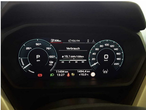
Figure 15: Misc.