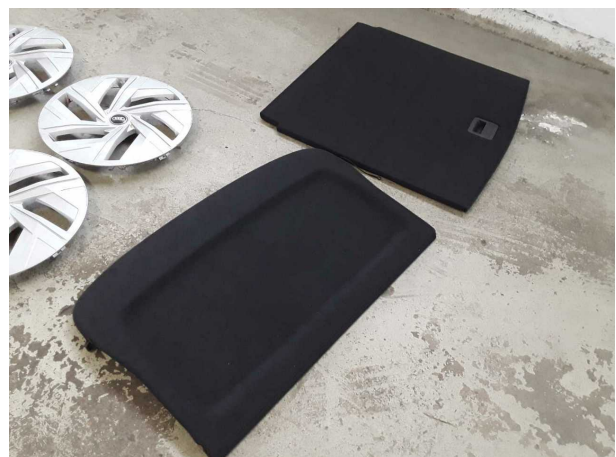
Figure 18: Misc.