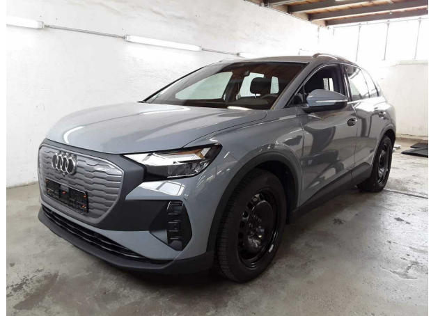
Figure 2: Diagonal front