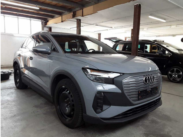
Figure 1: Diagonal front