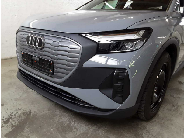
Damage #2: Front bumper: Front bumper - Scratched - Paint