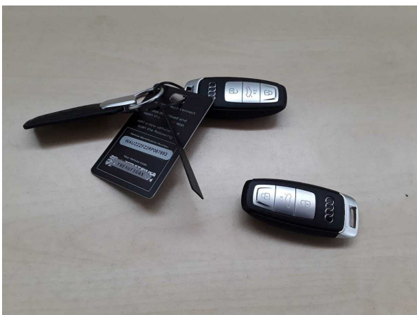
Figure 11: Misc.