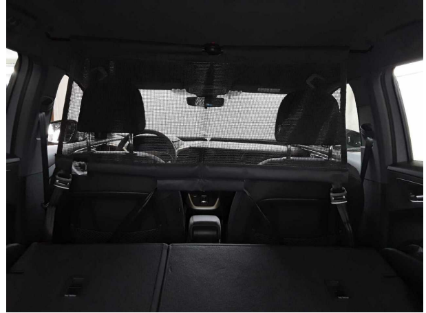
Figure 26: Misc.