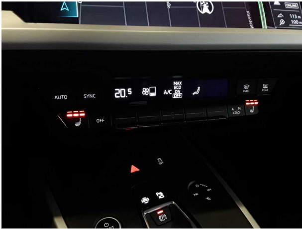
Figure 7: Interior