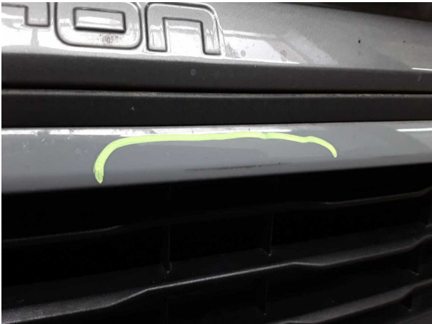
Damage #2: Front bumper: Front bumper - Scratched - Paint