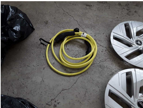
Figure 21: Misc.