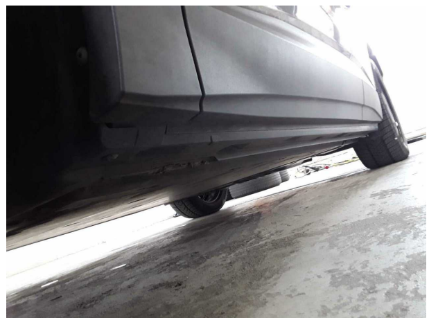
Figure 12: Misc.