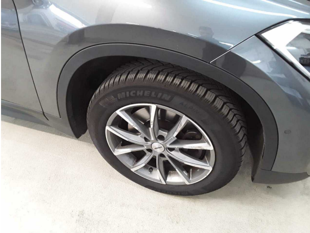
Damage #1: Wheel / tyres: Alloy rim - front right side - Scratched - No deduction