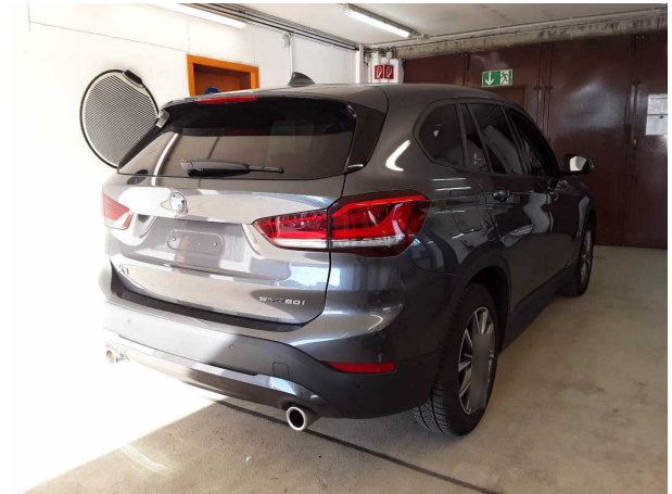
Figure 4: Diagonal rear