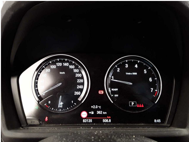
Figure 13: Misc.