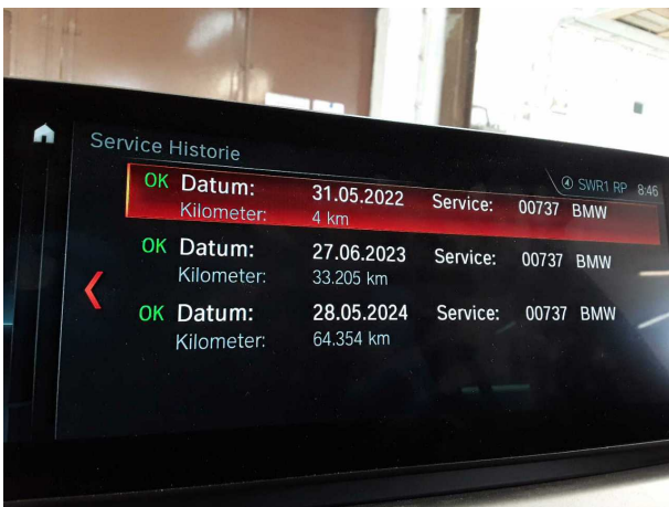
Figure 15: Misc.