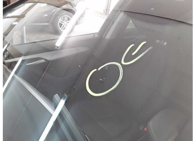
Damage #3: Vehicle glazing: Windscreen (Rissbildung) - Stone chips - Replace