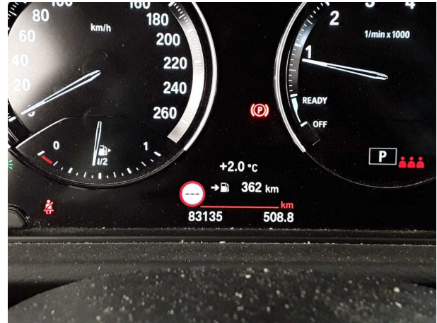
Figure 14: Misc.