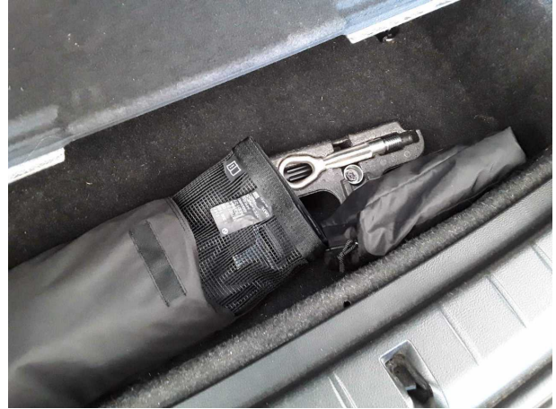
Figure 20: Misc.