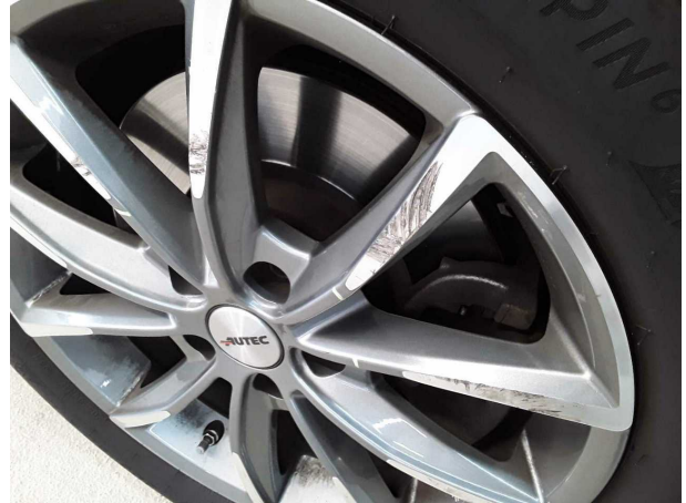
Damage #1: Wheel / tyres: Alloy rim - front right side - Scratched - No deduction