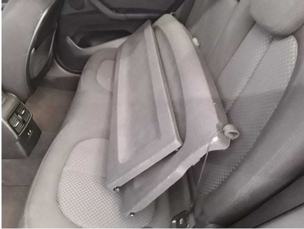
Figure 25: Misc.