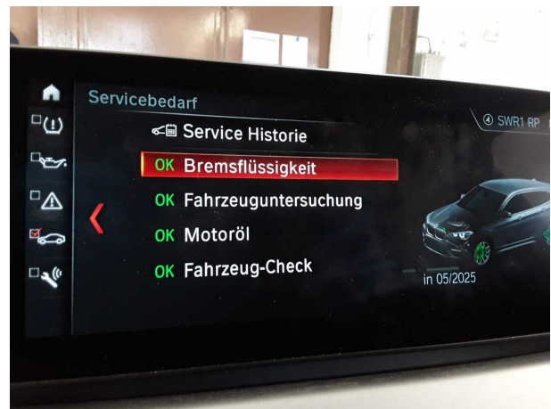
Figure 16: Misc.