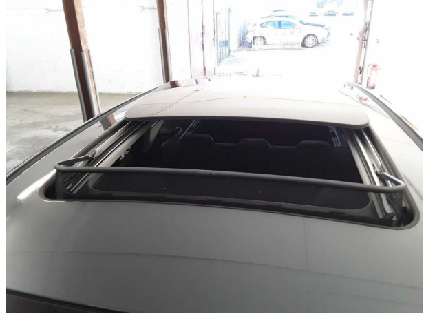
Figure 26: Misc.