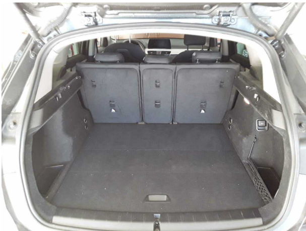
Figure 21: Misc.