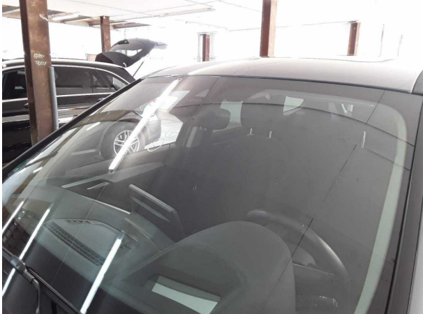
Damage #3: Vehicle glazing: Windscreen (Rissbildung) - Stone chips - Replace