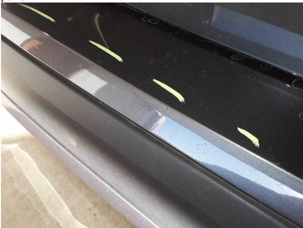
Damage #2: Rear bumper: Rear bumper - Scratched - Repair and paint