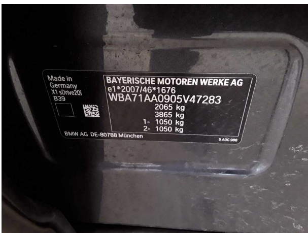
Figure 23: Misc.