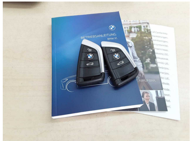
Figure 10: Misc.