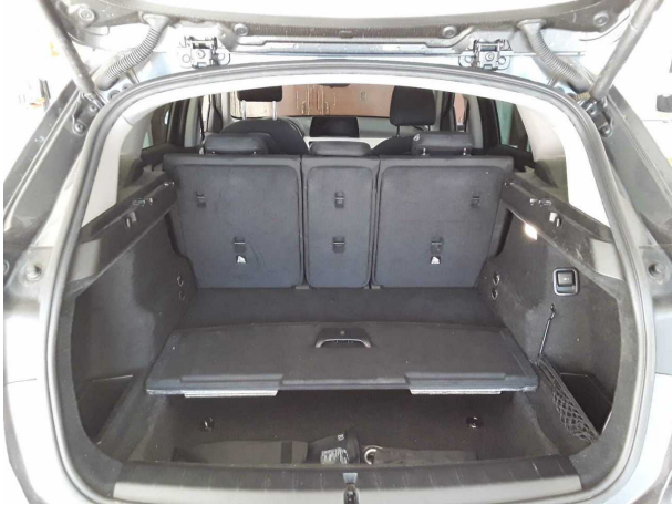
Figure 19: Misc.