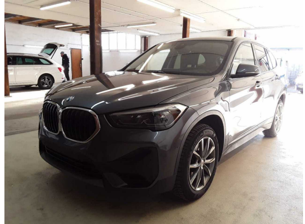
Figure 2: Diagonal front