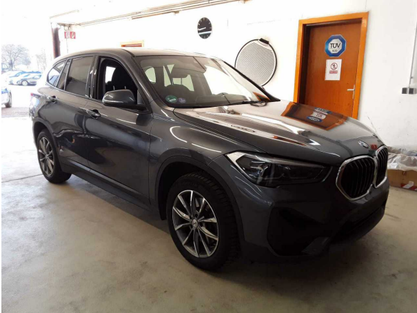
Figure 1: Diagonal front