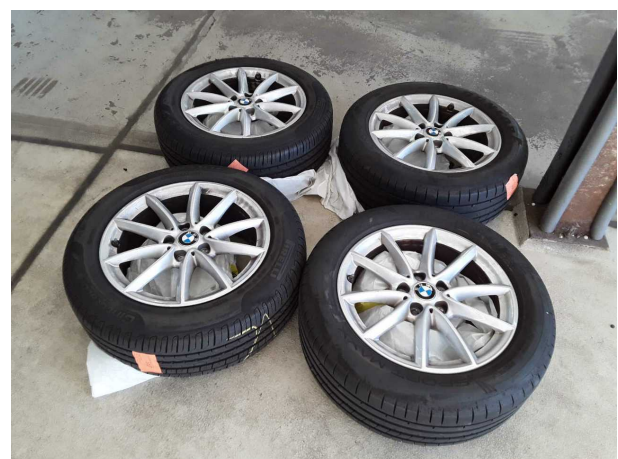
Figure 18: Misc.