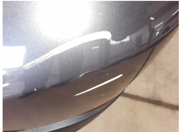
Damage #2: Rear bumper: Rear bumper - Scratched - Repair and paint