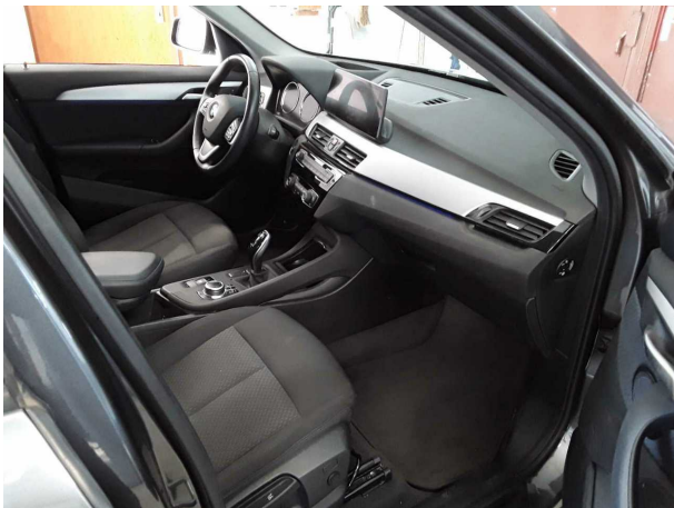
Figure 9: Interior