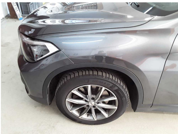
Figure 11: Misc.