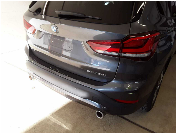
Damage #2: Rear bumper: Rear bumper - Scratched - Repair and paint