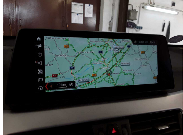
Figure 8: Interior