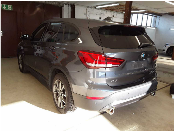
Figure 3: Diagonal rear