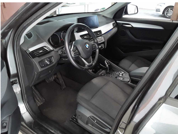
Figure 5: Interior