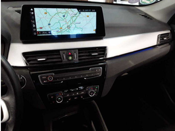
Figure 7: Interior