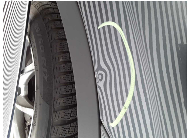
Damage #4: Side panel - rear left side: Side panel - Dent / paintcoat damage - Repair and paint