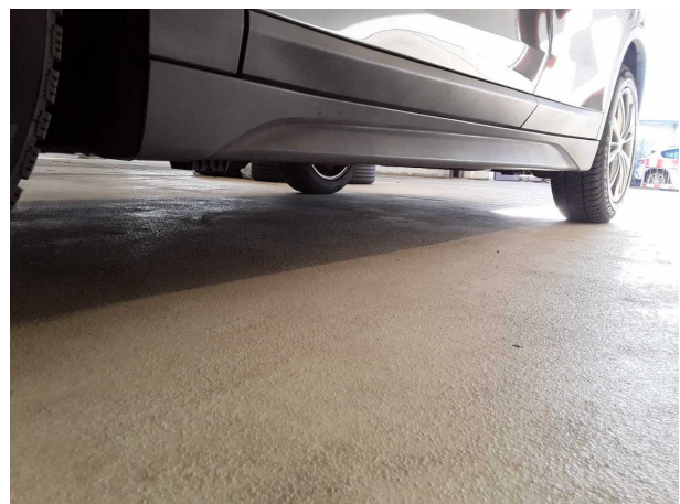
Figure 12: Misc.