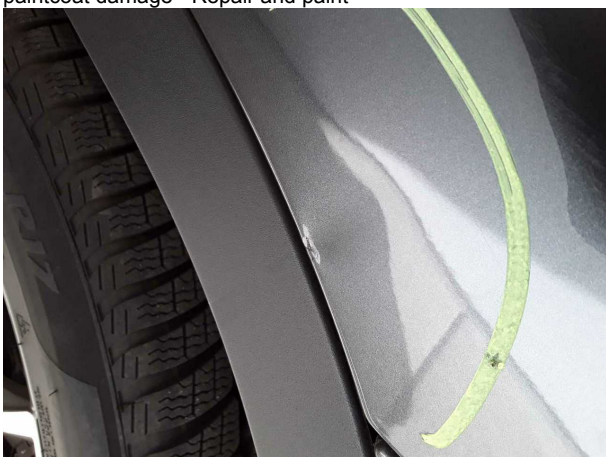
Damage #4: Side panel - rear left side: Side panel - Dent / paintcoat damage - Repair and paint