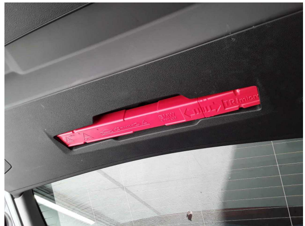
Figure 22: Misc.