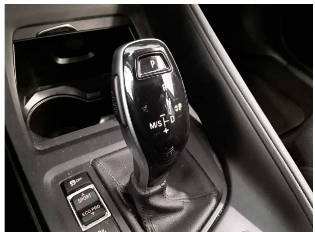
Figure 6: Interior