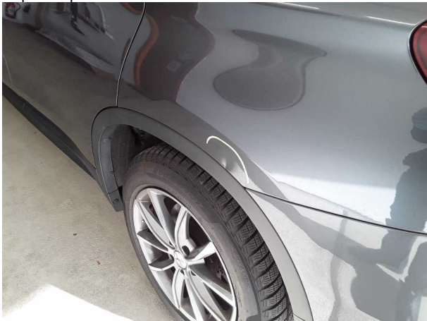
Damage #4: Side panel - rear left side: Side panel - Dent / paintcoat damage - Repair and paint