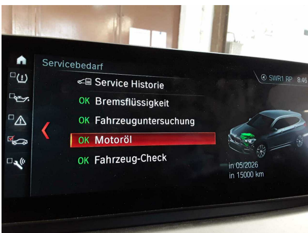
Figure 17: Misc.